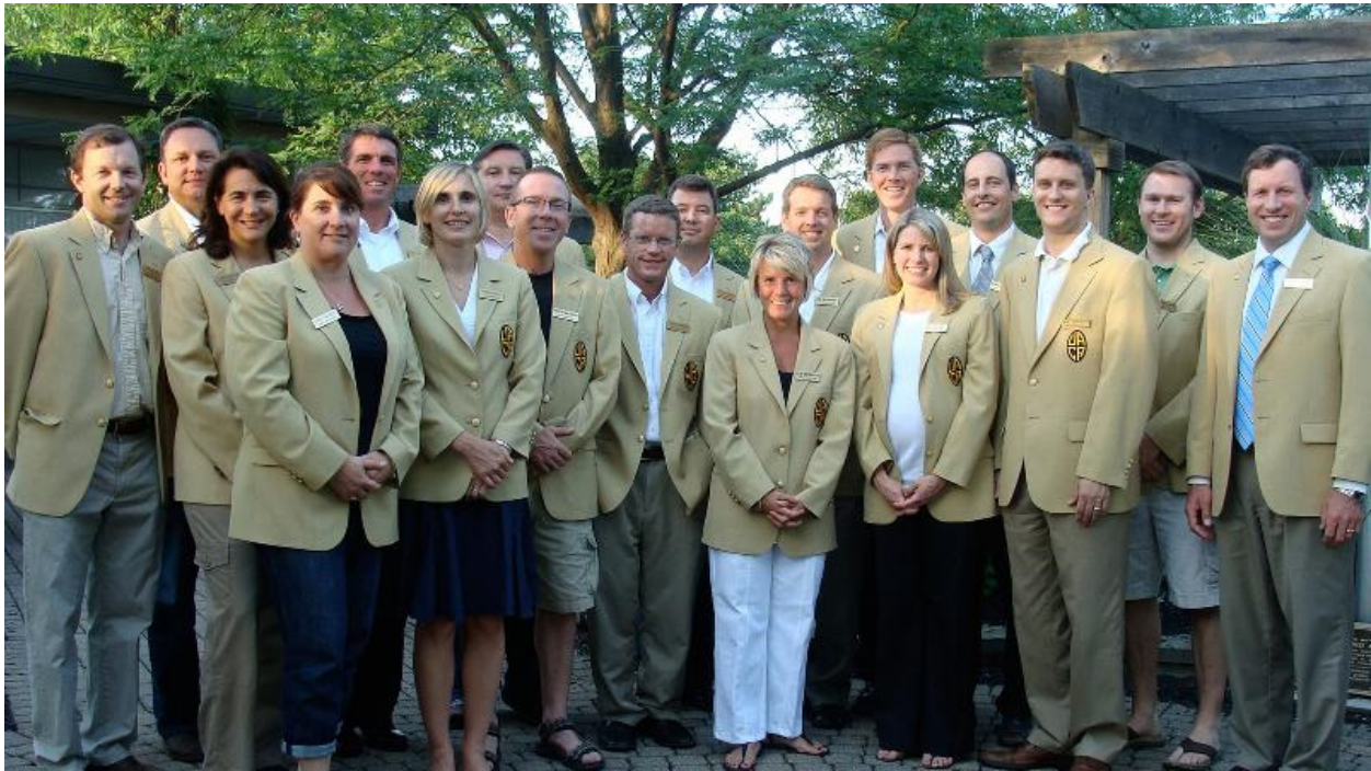
2010 Upper Arlington Civic Association Directors: