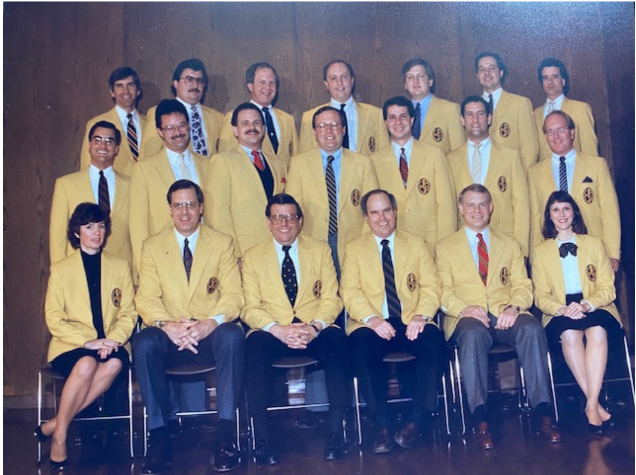
1990 Upper Arlington Civic Association Directors (L-R):