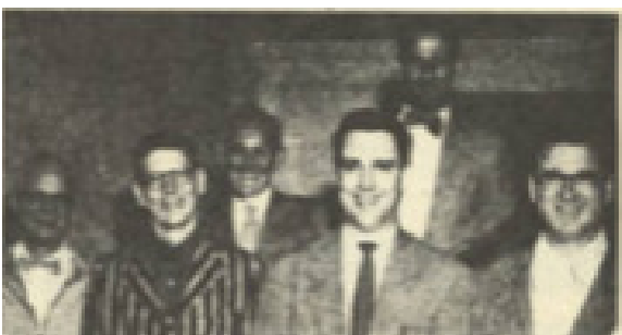
1953 Upper Arlington Civic Association Directors (L-R):